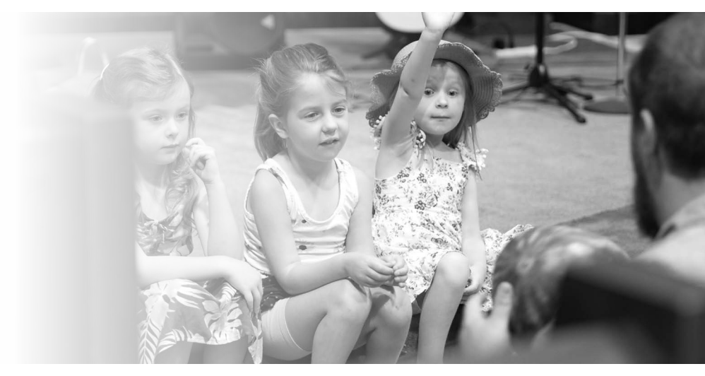
"It has often been said, 'youth are the future of the church.' But we know, for this to be true, we must support our youth today." Read more on page 2