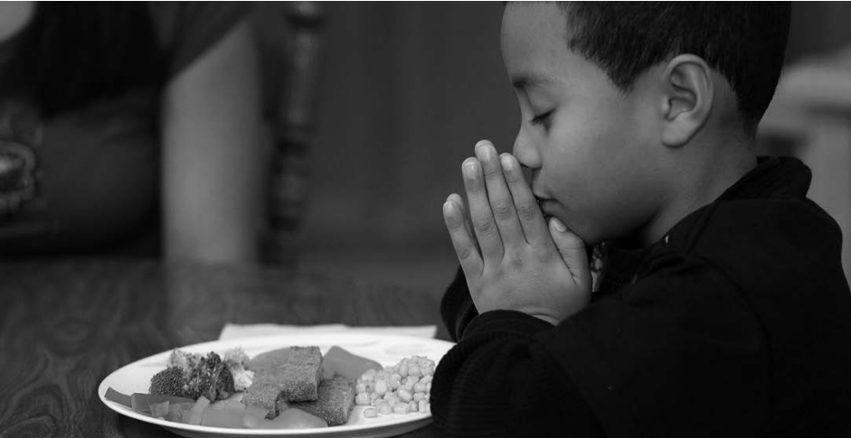
"Adults may set aside time for more intense prayer, study, and service. But what do families, especially those with younger children, do at home for Holy Week and Easter?" Read more on page 2