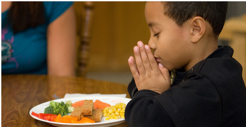
"Adults may set aside time for more intense prayer, study, and service. But what do families, especially those with younger children, do at home for Holy Week and Easter?" Read more on page 2