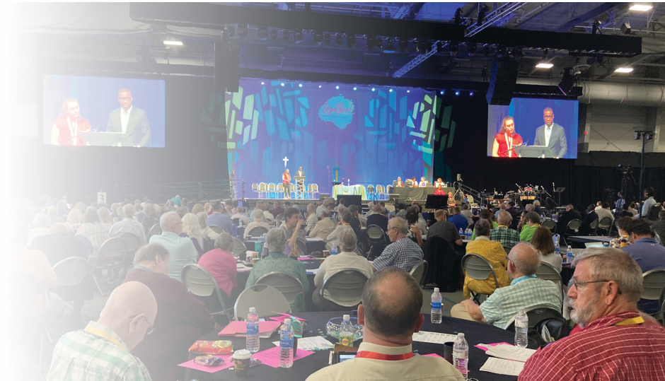
"We are not waiting for the disorientation to end. We are not waiting for the challenges to go away."