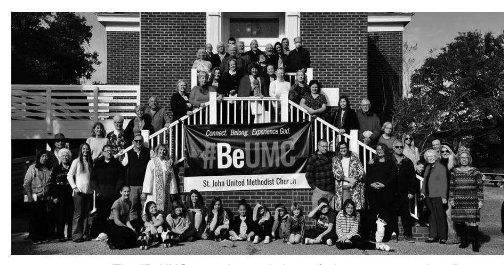
"The #BeUMC campaign reminds us of who we are at our best." Read more on page 2