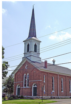
Port Gibson UMC

In October 2019, Port Gibson UMC members noticed several cracks along the exterior walls and other locations within the sanctuary. The Conservancy came and