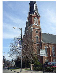
Broad Street UMC

Applying for the grant was a lot of work. You need to provide information about the property itself, how the building is used for outside organizations, and all the details about the project including bids from contractors.