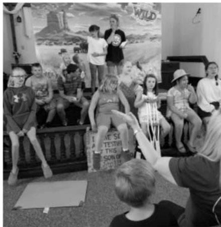
church’s VBS. Contact news@unyumc.org with your story.

As summer is nearing its end, see what fall events are coming around the Upper New York Conference at http://bit.ly/UNYcalendar