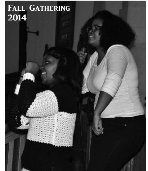
FALL GATHERING 2014

most of the time knowledge. Being a disciple of Jesus means to follow Him and His ways, this includes not only saying you are a Christian, but also showing it in your actions through everyday living."