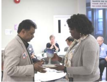
The time of training with the Kaleidoscope Institute ended with the sacrament of Holy Communion.

While this was just the beginning of a lot of work that is to come, the feeling in the room seemed to be one of excitement about the future.