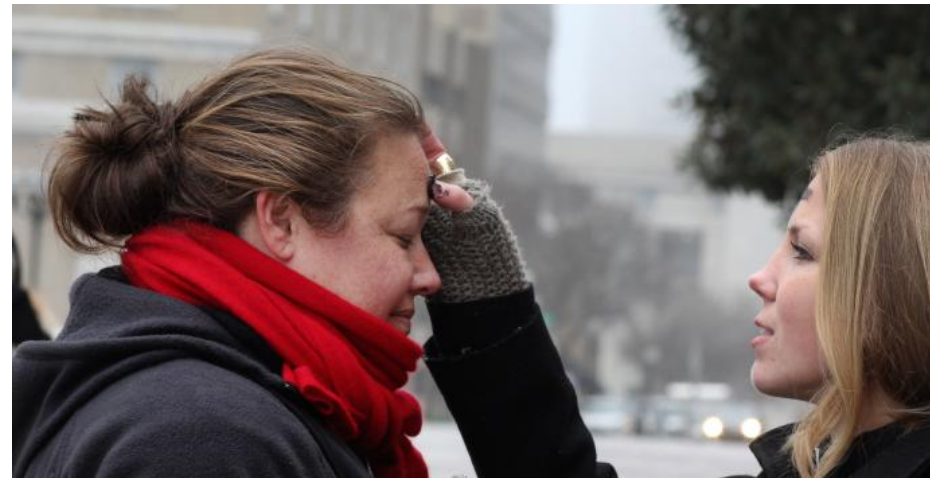
Many receive a cross of ashes on their foreheads on Ash Wednesday, an ancient symbol of our humanity.

Ash Wednesday usually begins with a service where we recognize our mortality, repent of our sins, and return to our loving God. We recognize life as a precious gift from God and return our lives toward Jesus Christ. We may make resolutions and commit to change our lives over the next 40 days so that we might