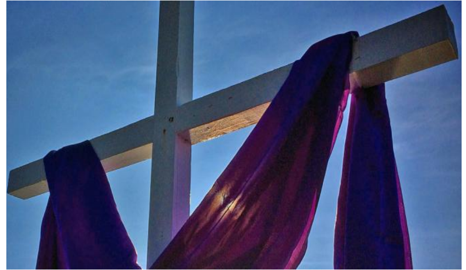
Many receive a cross of ashes on their foreheads on Ash Wednesday, an ancient symbol of our humanity.

be more like Christ. At the service, a pastor usually marks the sign of the cross on a person's forehead with ashes because ashes are a sign of mortality — when we die, we become dust, dirt, or ashes — and repentance — people used to put ashes on their heads to show remorse.