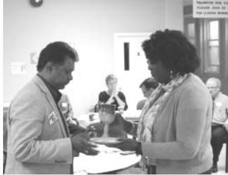
The time of training with the Kaleidoscope Institute ended with the sacrament of Holy Communion.

While this was just the beginning of a lot of work that is to come, the feeling in the room seemed to be one of excitement about the future.