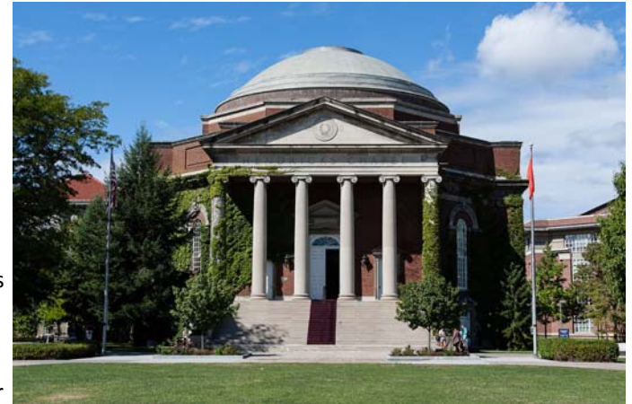
Hendricks Chapel at Syracuse University