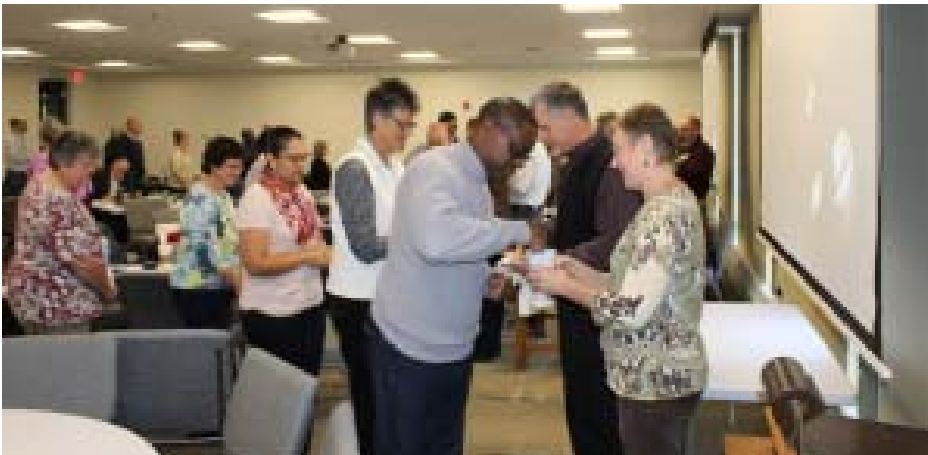
Members of the CLT and DLTs followed worship with the sacrament of communion as their time started together on Oct. 28.

On Saturday, Oct. 28, the Conference Leadership Team (CLT) hosted the District Leadership Teams (DLTs) from all 12 Districts in the Upper New York Conference at the United Methodist Center in Liverpool. The day followed the Loving, Learning, Leading (L3) meeting model that the CLT has been using for their monthly meetings.