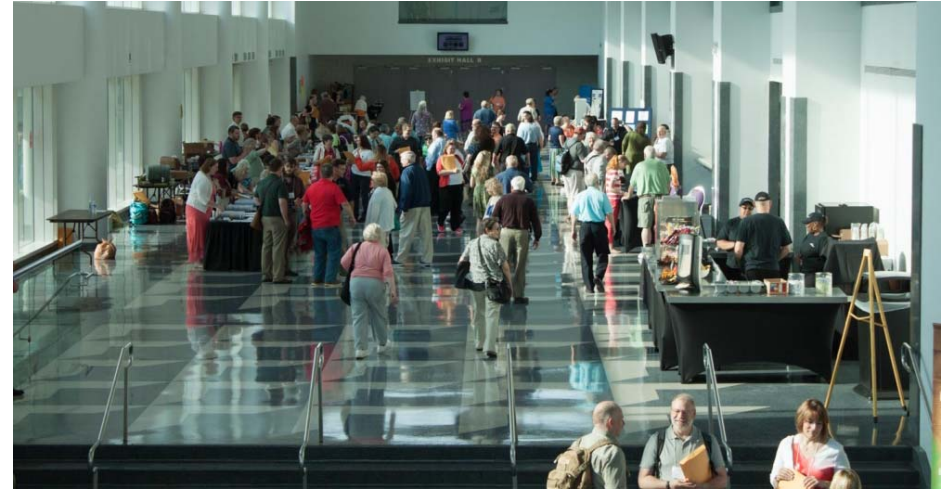
The Upper New York Annual Conference will be held June 1-3 at the Oncenter in Syracuse.

On Wednesday May 31, the day before the 2017 Upper New York Annual Conference, the doors of the United Methodist Center will be open for all from 3:30 p.m. – 7:30 p.m. The Open