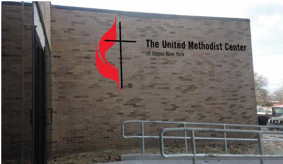
The new United Methodist Center of Upper New York will open March 22, with an Open House and Service of Dedication being held on May 31.

UpWord! is the spring event held by the Upper New York Conference's Council of Youth Ministry (CCYM). The theme this year, short and to the point, is "God is." UpWord! 2017 is an opportunity for youth from all over the Upper New York Conference to experience community and grow in their spiritual journeys through worship experiences, workshops, late night activities, and fun interactions. The event will be held March 31-April 2 at the Holiday Inn in Liverpool, N.Y. For more information and to register, visit http://www.unyumc.org/events/upword .