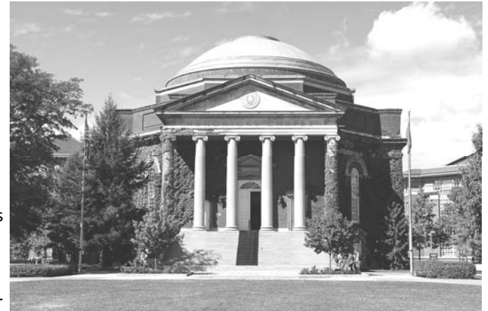
Hendricks Chapel at Syracuse University