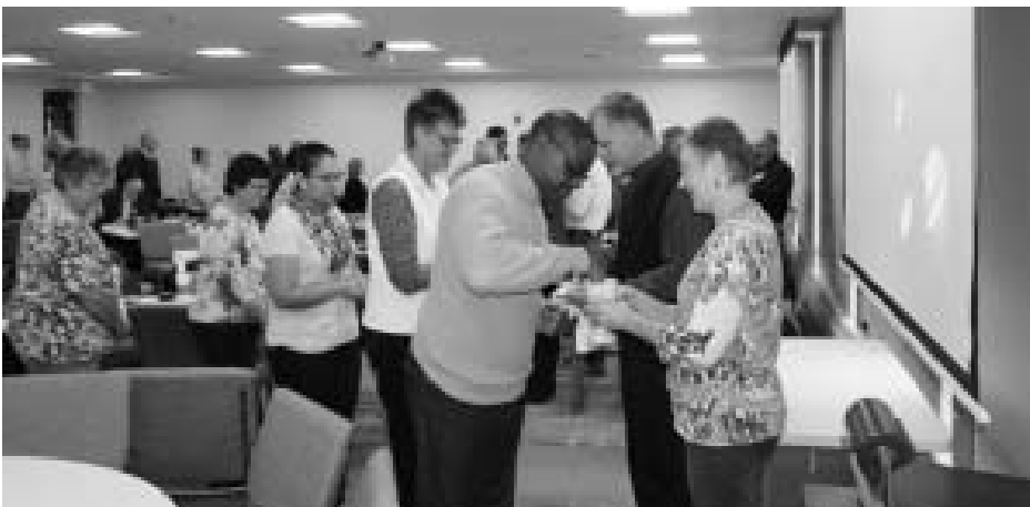
Members of the CLT and DLTs followed worship with the sacrament of communion as their time started together on Oct. 28.

On Saturday, Oct. 28, the Conference Leadership Team (CLT) hosted the District Leadership Teams (DLTs) from all 12 Districts in the Upper New York Conference at the United Methodist Center in Liverpool. The day followed the Loving, Learning, Leading (L3) meeting model that the CLT has been using for their monthly meetings.