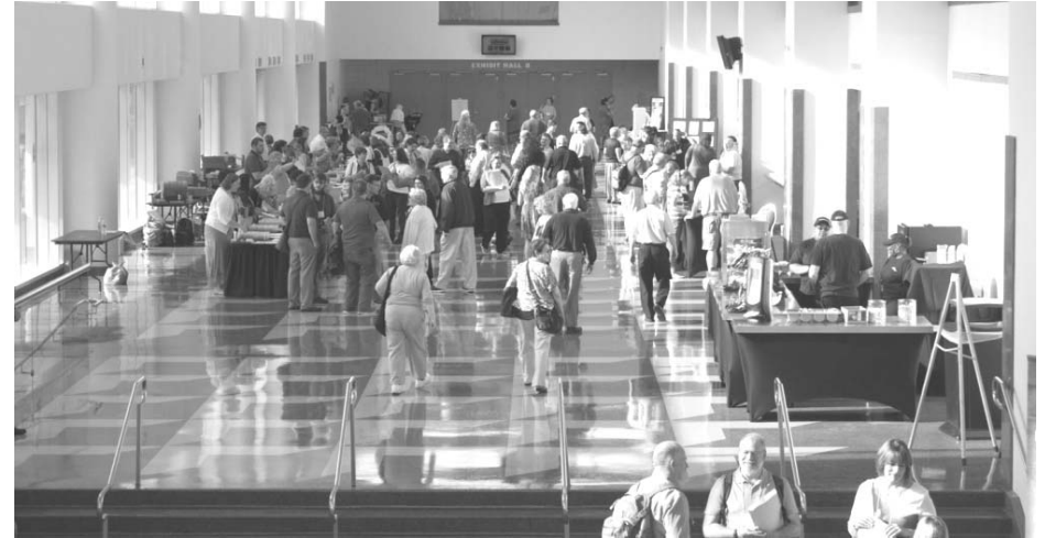
The Upper New York Annual Conference will be held June 1-3 at the Oncenter in Syracuse.

On Wednesday May 31, the day before the 2017 Upper New York Annual Conference, the doors of the United Methodist Center will be open for all from 3:30 p.m. – 7:30 p.m. The Open