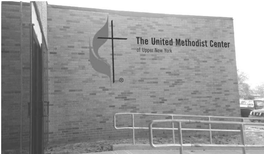
The new United Methodist Center of Upper New York will open March 22, with an Open House and Service of Dedication being held on May 31.

UpWord! is the spring event held by the Upper New York Conference's Council of Youth Ministry (CCYM). The theme this year, short and to the point, is "God is." UpWord! 2017 is an opportunity for youth from all over the Upper New York Conference to experience community and grow in their spiritual journeys through worship experiences, workshops, late night activities, and fun interactions. The event will be held March 31-April 2 at the Holiday Inn in Liverpool, N.Y. For more information and to register, visit http://www.unyumc.org/events/upword .