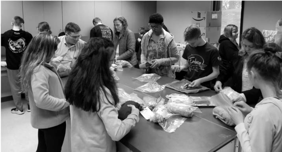
Pictured are youth who attended the OUTWARD Retreat assembling flood buckets as part of their fun-packed, mission-driven weekend of fellowship. Consider gathering up youth from churches in your area to assemble UMCOR kits.

UMCOR is always in need of flood buckets, hygiene kits, and school kits. The UNY Mission Central HUB is the perfect place to assemble these kits and we can coordinate efforts to get these supplies to UMC's Mission Central in Penn-